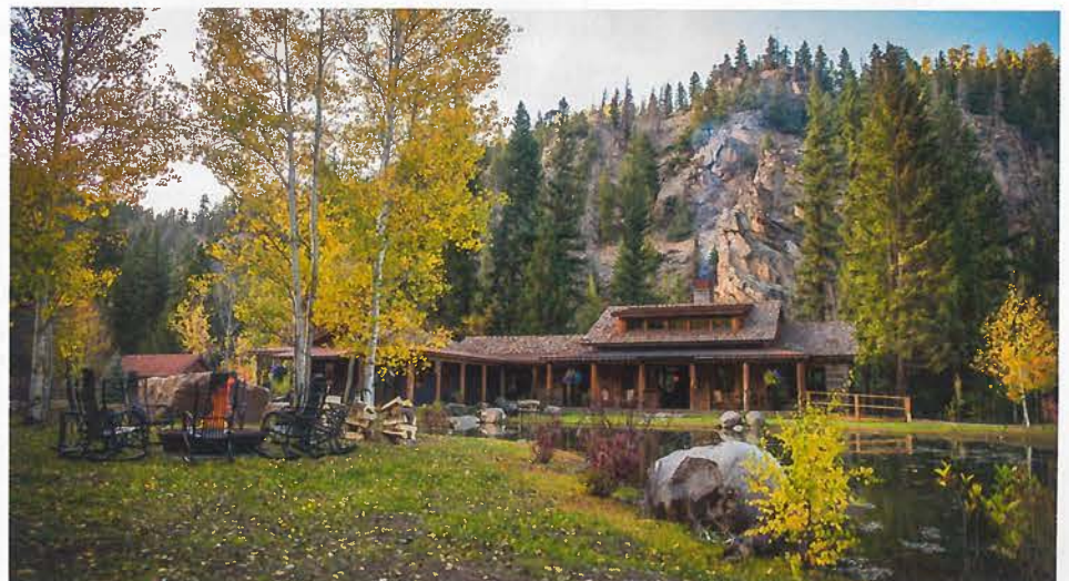
Taylor River Lodge is an outdoorsman's paradise—luxurious and charming