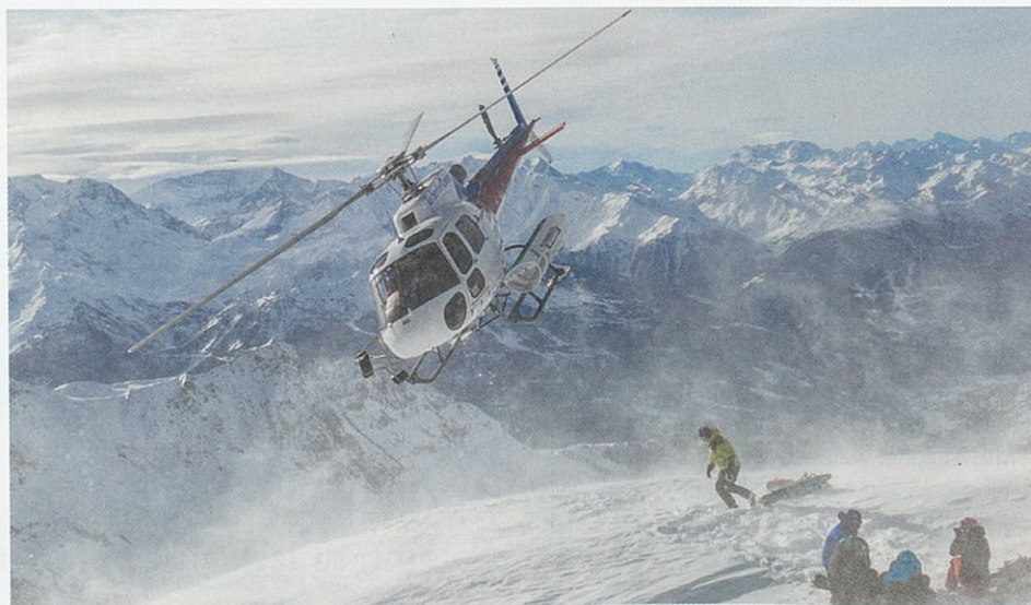
Left: One of the glass-fronted bedrooms of Chalet Sapphire in Morzine. Above: Heli-skiing is one of the many activities included with Chalet Hibou in Le Miroir

The most recent addition to the Eleven portfolio is the seven-bedroom Chalet >