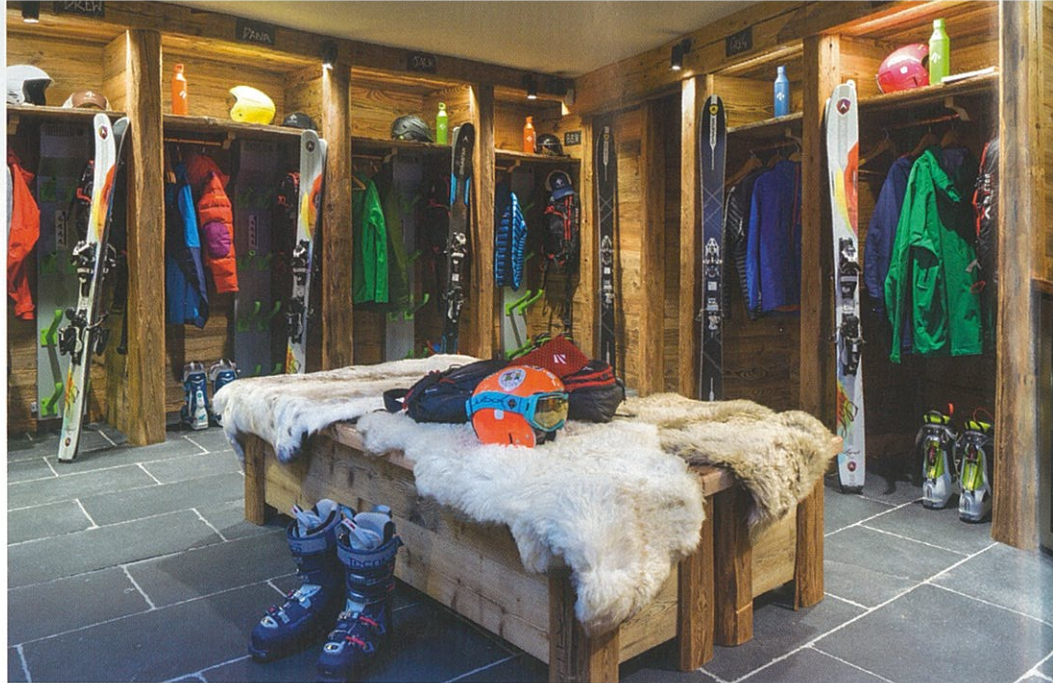
The boot room at Chalet Hibou is the perfect place to start and end a day on the mountain

The pièce de résistance, however, is undoubtedly the chance to cross the Italian